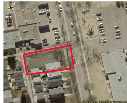
9115 143 St-Location